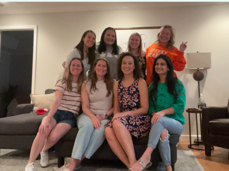
GMM house meeting