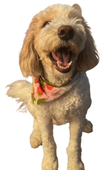
Penny, (Un)official Mascot of 2022 - 2023 Communications Council